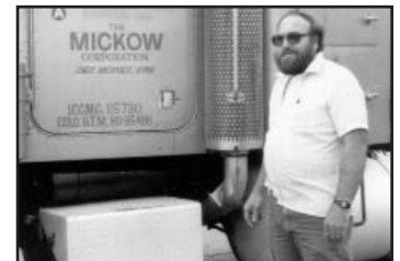
The early years: a driver stands in front of his truck with "The Mickow Corporation" decal on it.

TMC (no longer known as The Mickow Corporation - just TMC) has experienced steady, sound growth since that first load was hauled in 1972. Today, TMC is the largest privately-held flatbed carrier in the nation. We now generate more revenue in one day than we did in the entire first year we were in business!