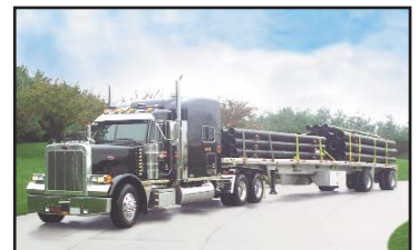
Today: one of our black Peterbilt trucks at the Des Moines corporate office.