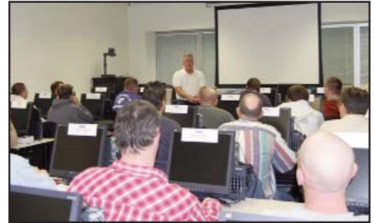
TMC Transportation maintains one of the premier orientation and training programs in the industry today.