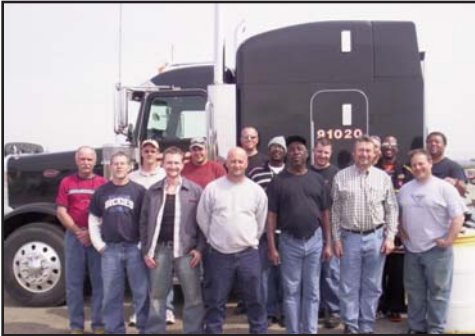
At the conclusion of the over-the-road training you will graduate to your own rig and join the ranks of the "Black & Chrome" family!

The job our professional drivers do require a lot of skill, thinking and motivation. To help drivers do their job, our training program teaches the driver one-on-one how to operate the truck in the most efficient and safest way possible. The first week of orientation educates and informs our drivers on the company, benefits, policies, safety, defensive driving, math skills, and more. The second week consists of load securement to learn how to secure various flatbed loads, and yard training, where drivers actually maneuver trucks and get to know our equipment. The following weeks are spent in a truck over the road with an individual trainer.