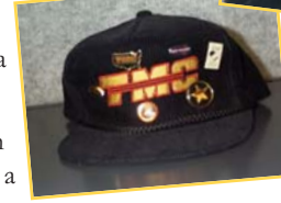
Left, several of the hatpins drivers can earn for their hats!